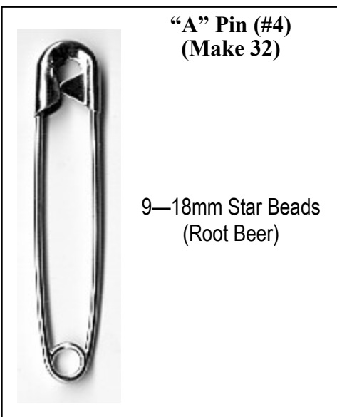
"A" Pin (#4) (Make 32)

Row 1: Starting at the bottom of the teddy bear. Using a 12" piece of wire, * thread wire through the bottom loop of 1 - "A" Pin, add 1 - 10mm Faceted Bead. Repeat from * until 16 - "A" Pins and 16 - 10mm Faceted Beads have been used. Pull tight. Twist and cut off excess wire.